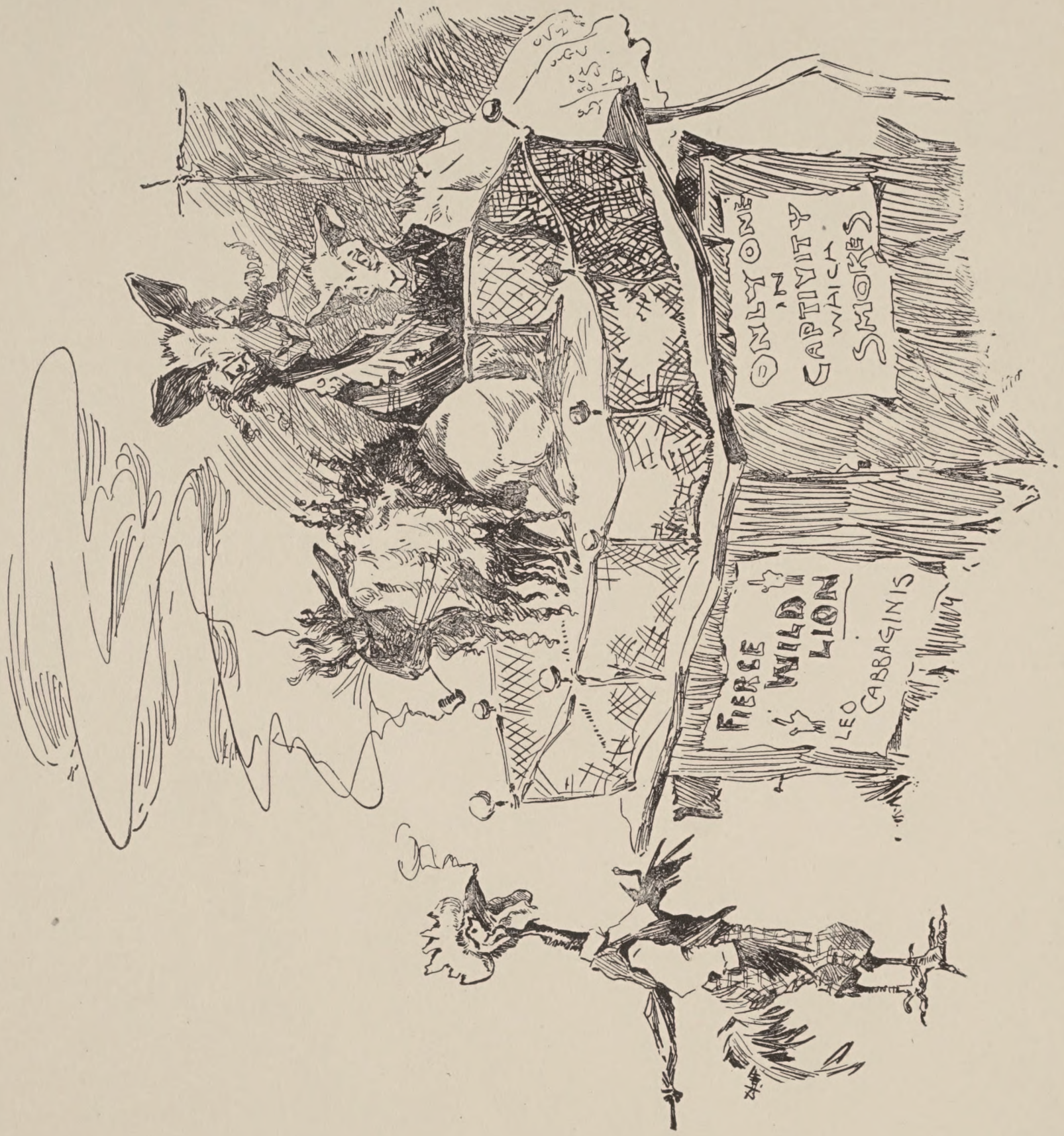
WHITE RABBIT PRETENDS TO BE A LION.